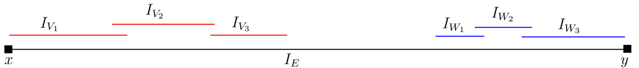
FIGURE 3. Examples of V_i \swarrow E and E \searrow W_i .

However, the above example does not capture all the ways in which we can have V \swarrow E or E \searrow V . Consider a decomposition of a Teichmüller geodesic by the active intervals corresponding to witnesses illustrated in Figure 3.